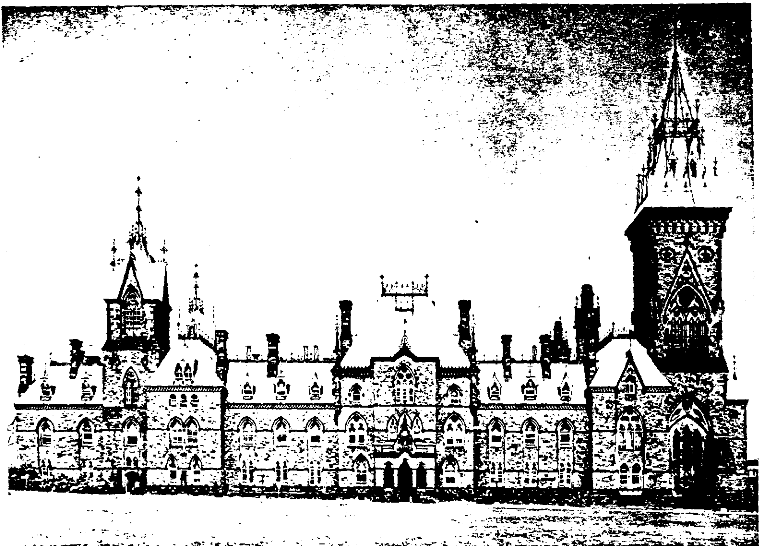
East Block from the centre of Parliament Hill.