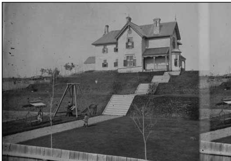
Garland residence 1873