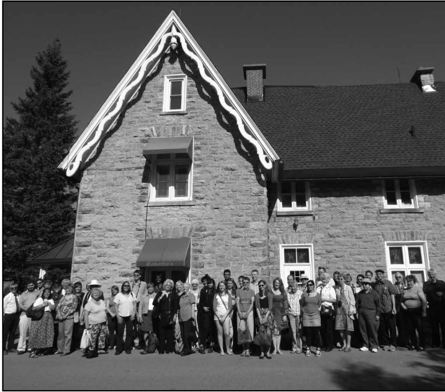
Tour group at Cabotto's restaurant