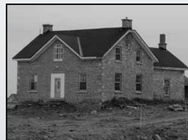
Davidson-Hope farm house before and after: