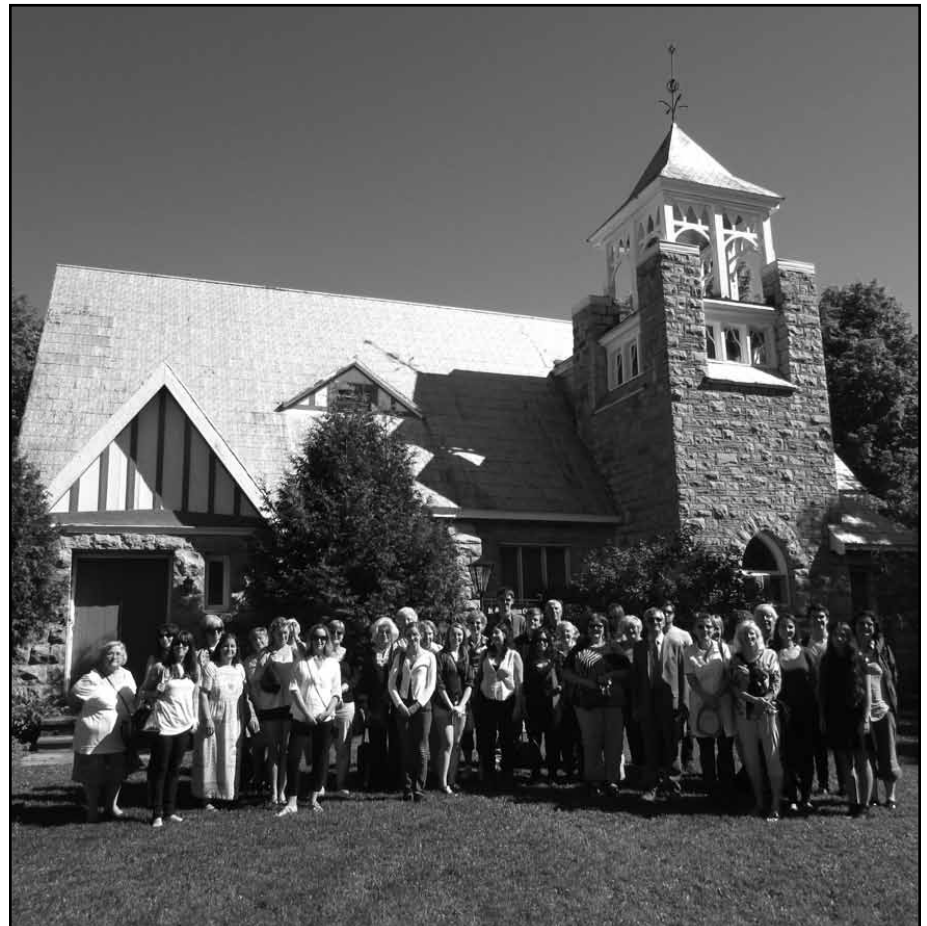
Tour group at New St Mary's Church, Parish of March